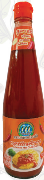
Sriracha Chilli Sauce 640 g