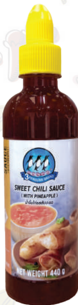
Sweet Chili Sauce With Pineapple 440 g