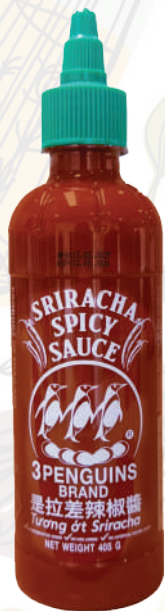
Sriracha Spicy Sauce 405 g