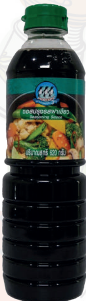
Seasoning Sauce 620 ml