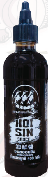
Hoisin Sauce 400 g