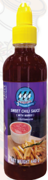
Sweet Chili Sauce With Mango 440 g