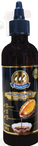
Abalone Sauce 425 g