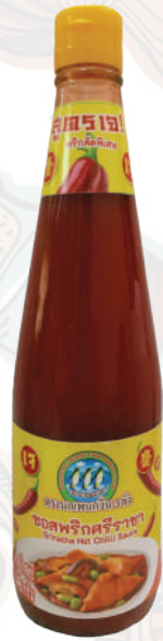
Sriracha Chilli Sauce (Vegan) 640 g