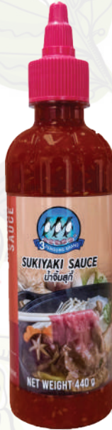
Sukiyaki Sauce 440 g