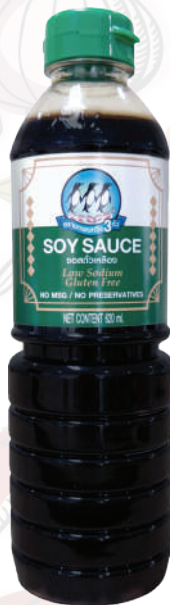
Soy Sauce Low Sodium Gluten Free 620 ml