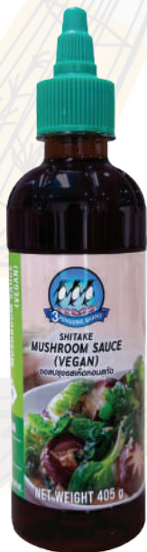
Shitake Mushroom Sauce (Vegan) 405 g