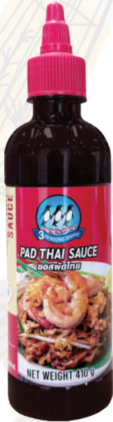
Padthai Sauce 410 g