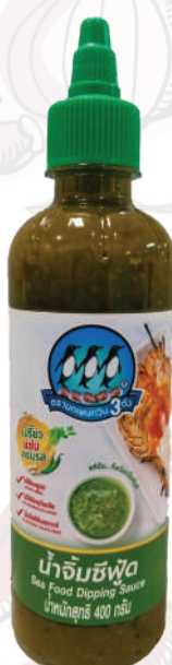
Sea Food Dipping Sauce 400 g