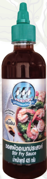
Stir Fry Sauce 425 g