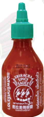
Sriracha Spicy Sauce 220 g