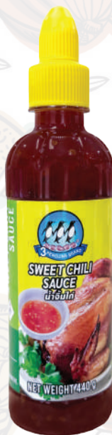
Sweet Chili Sauce 440 g