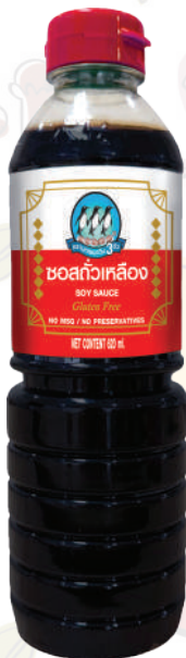
Soy Sauce Gluten Free 620 ml