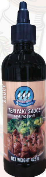
Teriyaki Sauce 425 g