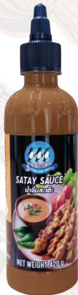
Satay Sauce 420 g