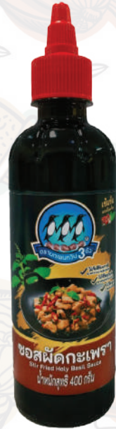
Stir Fried Holy Basil Sauce 400 g