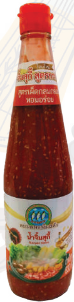
Sukiyaki Sauce 830 g